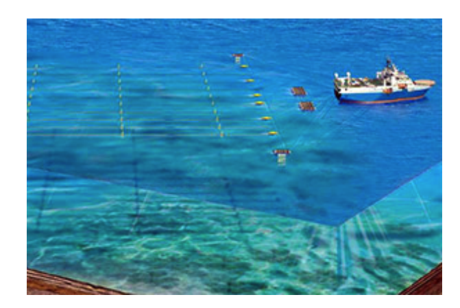
Fig. 1. A representation of the traditional ship towed methodology for geotechnical surveying.