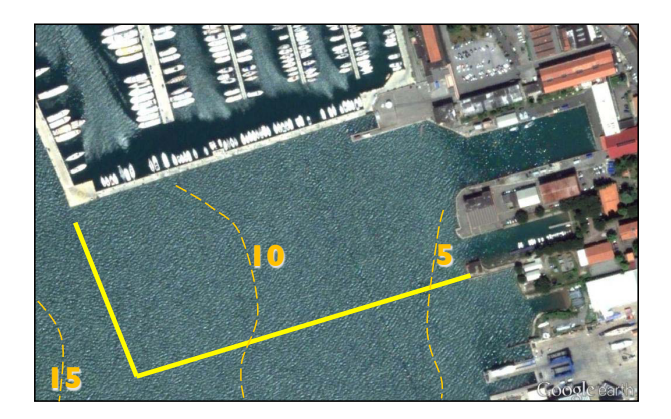
Fig. 4. La Spezia site for preliminary tests and integration.