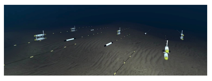
Fig. 2. Computer animation of a WiMUST mission towing streamers.

As for the long range communication requirements of the overall system, the exploitation of advantages given by sweep-spread communication technology of EvoLogics opens the way to practically achievable bit rates of about a several to tens kilobit/s in long range. While the range of data transmission and the capacity of the underwater acoustic channel may change vigorously in consequence of changes in environmental conditions, an efficient implementation of an acoustic communication network will strongly depend on the capability of the modem to automatically adjust its bit rate to the actual channel conditions.